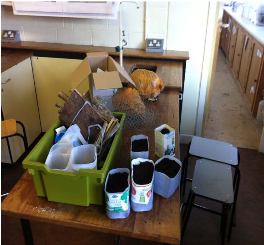
here are some of the insect homes and some plants