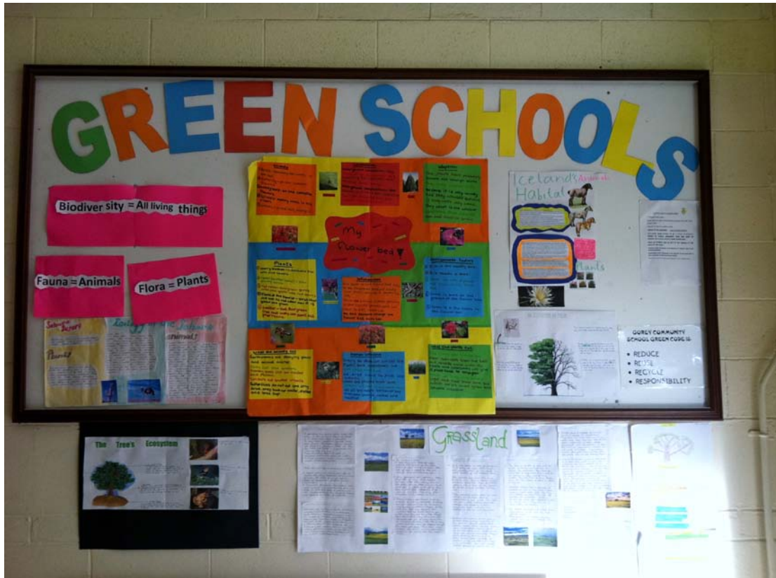
this was are green school notice bord