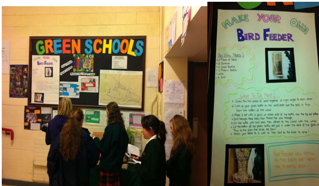
the opening night