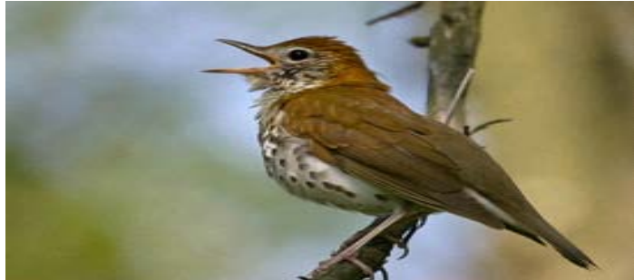
this is a wood thrush

to eat from and some insect home around for insects to stay there too and we are hoping to have a vegetable patch to put all those yummy vegetables we have grown into aswell . We are also on planing on setting up a wild flower garden soon.