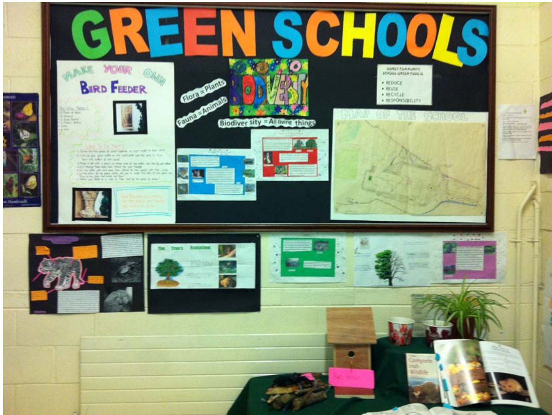
green schools notice board and display table