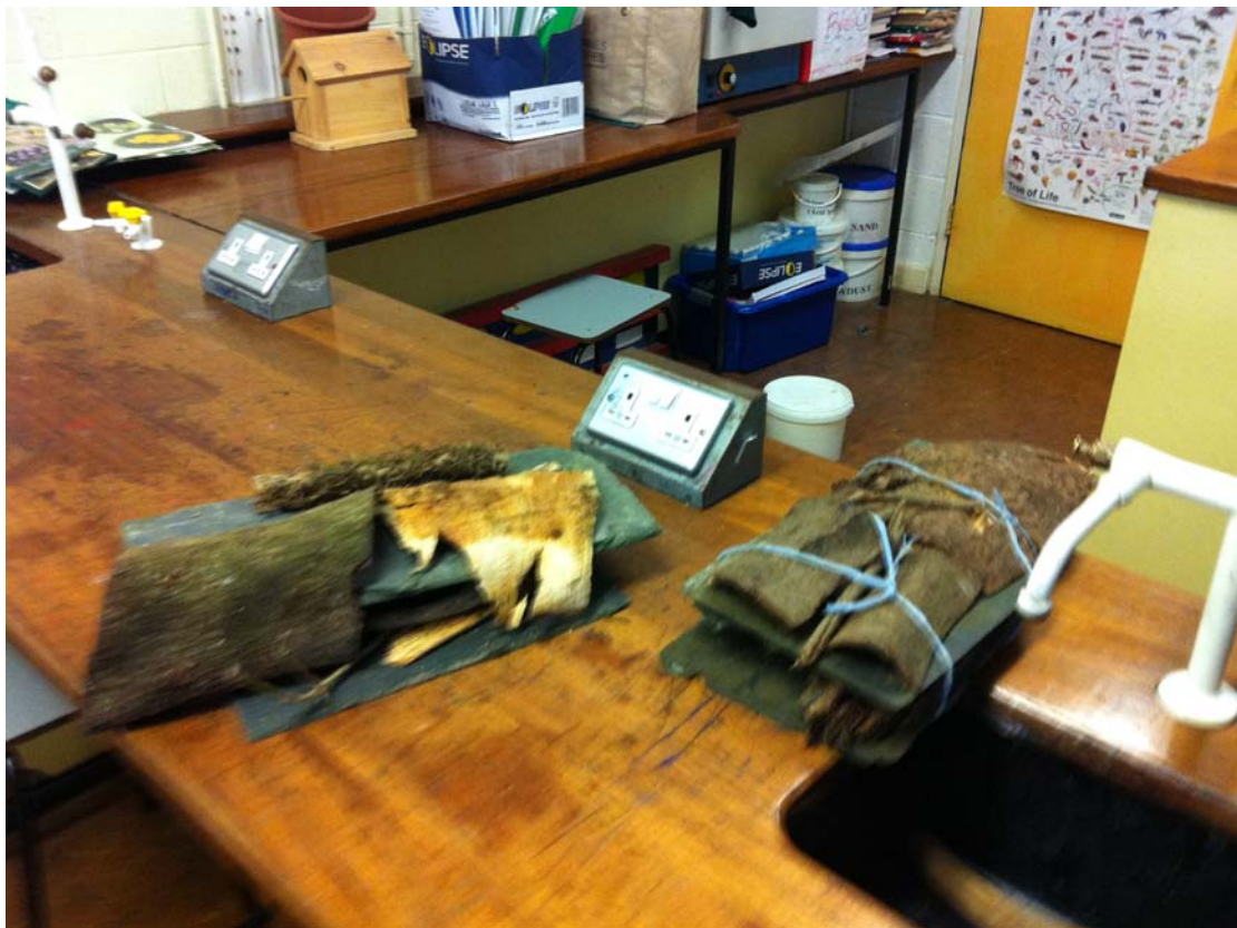
this is some of are lovely bird feeders